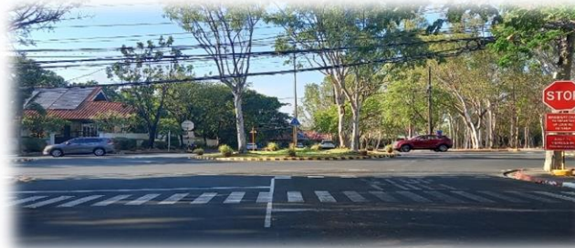
Roundabout #3 Don Manolo cor. Tirona