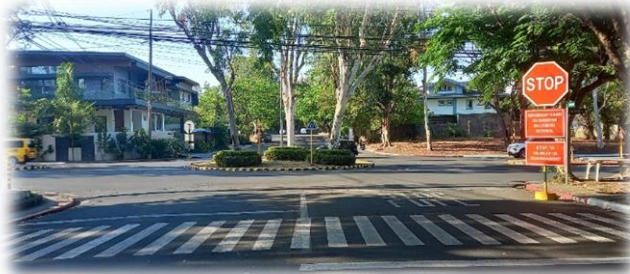
Roundabout #2 Doña Mary cor. Don Jesus